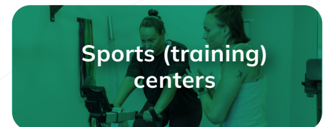
Sports (training) centers

Immediately recognizes muscle problems, imbalance of dietary measures, or any physical resistance in your patients to prescribe and follow-up with optimum therapy.